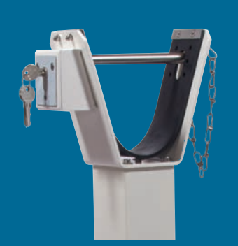
Profile cylinder lock at the fixed support (optional)