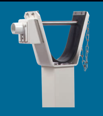
Fire emergency release at the fixed support, installed (optional)