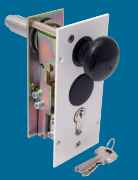
Locking device 1 and 2* Profile cylinder lock installed at the barrier stand (optional)