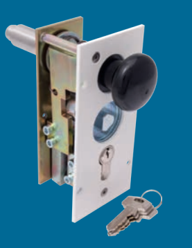
Locking device 3 and 4* Fire emergency release and profile cylinder lock at the barrier stand (optional)