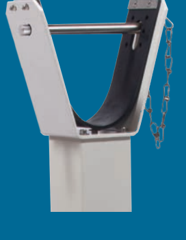
Stainless steel bolt at the fixed support, installed, for padlock (on site)